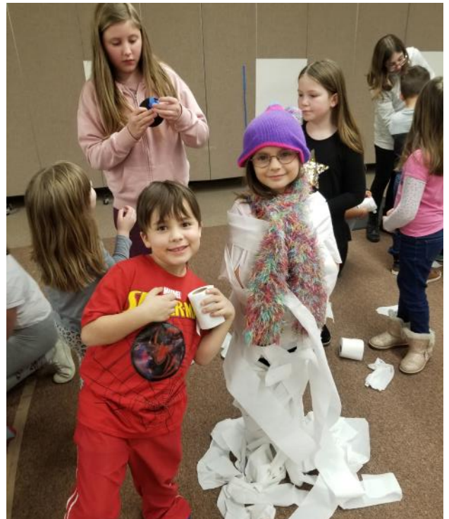
February's SNOW DAY, making snow men, relay races, and a marshmallow war before relaxing with a movie and popcorn.